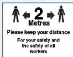
904STG-911 600 x 450mm