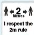
904STG-913 65 x 55mm stickers These are ideal for helmets on construction sites