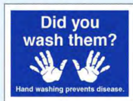
904 HYB.458F -300x200 904 HYB.458W -150x200