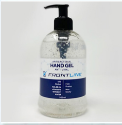
Product Code: 957M6852PM