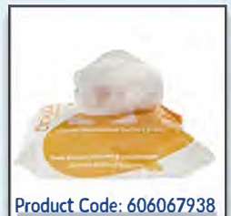
Product Code: 606067938