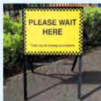
904 VCC.453 600-x450

This sign is ideal for people to wait in the correct place. It comes with a steel frame so is hard wearing and perfect for out door use