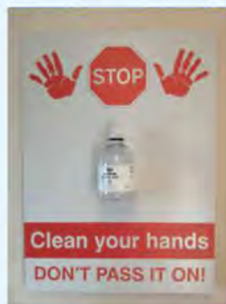
904VCC.91-450 x 600 in Dibond sign only