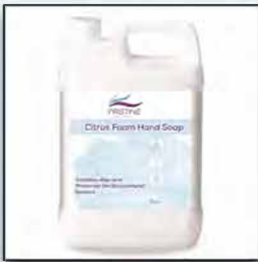
Product Code: 606061409