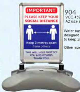
904 VCC.459 A2 size sign 420 x 594

Water base pavement sign is designed to help remind people to keep 2m apart