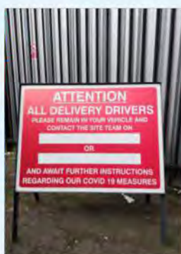
904CORO-41-1050x750mm Sign only 904CORO-41-1050x750mm Sign with frame