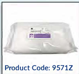
Product Code: 9571Z