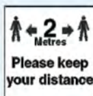
904STG-912 65 x 55mm stickers These are ideal for helmets on construction sites