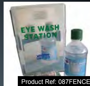
Product Ref: 087FENCE

Stock up your medical and first aid kits. Directa offer a wide range of plasters and bandages for all those accidents that may happen at the office, out on the road or at home.