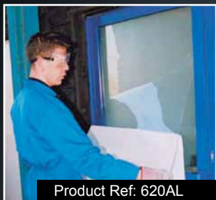
Product Ref: 620AL