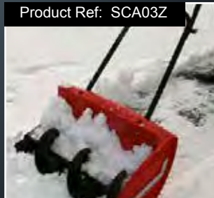
Product Ref: SCA03Z

Be prepared and beat the forecast, and don't get left out in the cold this winter. - The blades and the main body of this unit are manufactured from heavy duty plastic - Ideal for clearing Car Parks, Walkways, Pavements etc - Supplied Knock Down - Weight 4kg - Width 570mm - Handle Height 1230mm