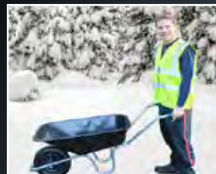
Product Ref: 982BARROW