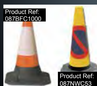
Product Ref: 087BFC1000