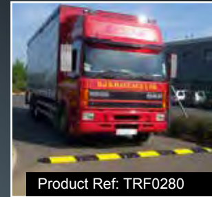
Product Ref: TRF0280

A durable, bitumen-based patch repair and overlay material for pot holed asphalt and concrete. Extremely fast and simple to use. Repairs can be driven over immediately and will withstand heavy traffic. Does not require hacking. Suitable for pot holes and dips in roads, car parks, drives etc. Ideal where maintenance time is limited. Withstands heaviest traffic.