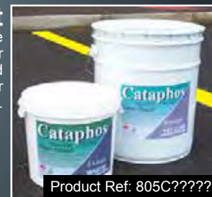
Product Ref: 805C?????

Cataphos Water Based traffic paint is very durable and kind to the environment. Being water based rather than solvent based, it is ideal for outdoor use for marking up road lines and car parks and can also be used in food storage areas and warehouses. Quick drying. Available in white or yellow and in 5 litre tubs or 18.5 litre drums.