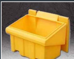
Product Ref: 98205250

Brown Rock Salt for clearing away ice and snow from paths, drives, patios and roads during the winter months. Supplied in a 25 Kilo Bag (approx).