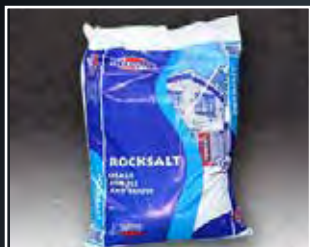
Product Ref: 982RSALT25B