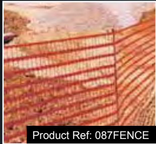
Product Ref: 087FENCE