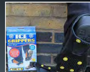
Product Ref: 982SHOEGP

This unit should be used with British Standard BS3247 salt and ice melt. The salt should be dry and free flowing. - Manufactured from heavy duty plastic with a Steel handle - 8 point adjustment system to increase and decrease the rate at which salt or seed is spread - Mobile on 2 x 200mm Plastic wheels - Supplied Knock Down Width 450mm, Handle Height 1070mm. Weight 3kg.