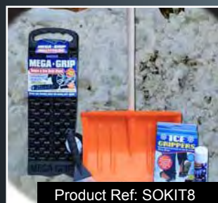
Product Ref: SOKIT8

This easy to use snow shovel makes light work of heavy snow. Made from plastic which means the snow will slide off quickly and easily. Also ideal for spreading salt and grit. Shovel head is 12 inches x 16 inches.