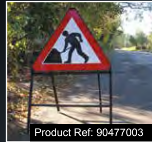
Product Ref: 90477003