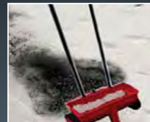
Product Ref: SCA06Y

This heavy duty 90 litre wheelbarrow enables the easy distribution of rock salt / grit around office premises, car parks and schools.