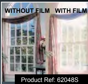
Product Ref: 62048S

Can be applied to existing windows and other glass panels not just new ones. It is completely undetectable when applied to glass, yet increases the strength of glazed areas to protect against vandals, fire, bomb attacks or industrial accidents. If a breakage does occur, the film holds the glass in place until it can be safely removed.