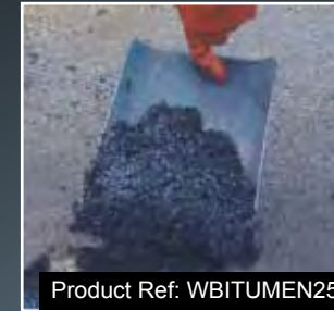
Product Ref: WBITUMEN25

All temporary road signs are manufactured to the required standard of the Road Traffic Sign Manual using Zintec class 1 reflective material so drivers are not dazzled by the road messages. The signs are bonded onto a durable back plate. Steel frame is sold separately.