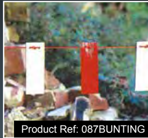
Product Ref: 087BUNTING

Our Deemark Brand Barrier Tape is bio-degradable, non adhesive and highlights the hazardous area with an easily recognisable, distinctive red and white band. Ideal for emergencies as it is easily transportable, very light and low cost in comparison to other methods. Manufactured using LLDPE which makes it easily disposable and environmentally friendly. Also available in yellow and black.