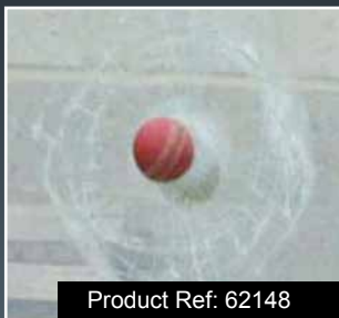
Product Ref: 62148

An emergency repair film specially developed to provide a fast and cost effective short term solution to the problem of broken windows, glass doors, partitions and panels, in schools, colleges, hospitals and other public buildings, as well as office blocks and factories, shops, stores and greenhouses. In fact anywhere that broken glass is a potential danger.