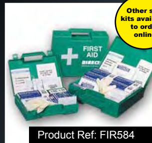
Product Ref: FIR584