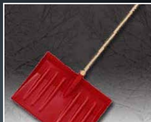
Product Ref: 982SCOOP

Keep salt and grit dry and secure ready for winter with this grit / salt bin. Fully weatherproof - reinforced lid fully seals the bin. Forklift Recess - ease of handling with forks or straps. Made from UV stabilised HDPE. Capacity - 250kg. Will hold 10 x 25kg bags of salt/grit. Full 290 degree opening.