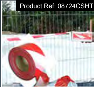
Product Ref: 08724CSHT

Barrier Fencing ( Euromesh ), is a modern method of barrier fencing for on site use. Made from bright orange reinforced polyethylene making the hazardous area highly visible and preventing accidental entry. Easily held in position with steel pins (Product Ref 087FENCEPI). Creates a temporary, high visibility barrier, to alert public/workers of potential hazards. Roll weight is 5.5kgs.