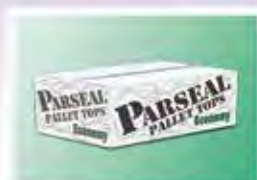
Economy Product Code: 075TOP120G