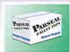
General Purpose Product Code: 075TOP200G