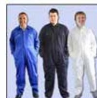
Boilersuits & Coveralls