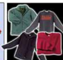
Fleeces & Sweatshirts

Available custom printed - call 01621 828882 with your requirements